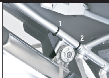
7 Position the right side wing against the exhaust mount. Install zip ties up from the bottom through the slots, around the frame and in through the outside slots.

WARNING AND DISCLAIMER: All parts manufactured, designed or sold by Machineart Moto ("MaMo") should be installed by a qualified motorcycle technician. The risk of injury is increased by improper installation or misuse of equipment. MaMo's customers must exercise good judgment in the use, control, alteration, part selection and installation, and maintenance of their motorcycles. In the event of a possible defect in material or design, or any other defect in a part manufactured, designed or sold by MaMo, the responsibility of MaMo is limited to a refund of the purchase price or the replacement of the part if MaMo determines the part to be defective, and subject to MaMo's inspection of the part within thirty (30) days from the date of purchase. (Note: any attempted repairs or modifications made to MaMo products will void this limited warranty). MaMo, under no circumstances will be responsible for incidental and/or consequential damages, property damage, personal injury damage, or damage, injury, cost or expense of any kind or nature whatsoever except as provided by law. MaMo makes no other warranty, express or implied, including without limitation any warranties of merchantability and fitness for a particular purpose.