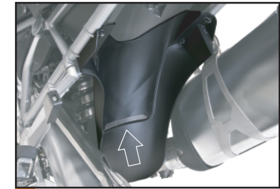
3 Position the MudSling "shoe" below the existing fender & pull up to engage it. Shown here with wheel removed.