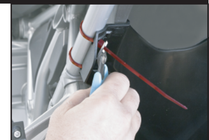
9 Cut off excess zip tie length with a wire cutter for best appearance.