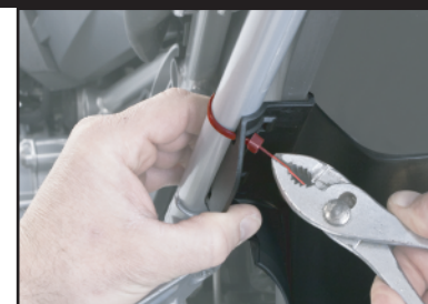
8 After pulling the zip ties as tightly as possible by hand, use pliers to tighten all zip ties fully.