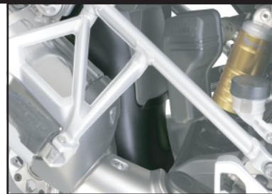
4 View from right side of bike: MudSling is shown properly engaged with the end of the fender.

Clean with soap and water. Use Armor-All to restore appearance.