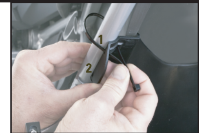
6 Loop the zip tie around the frame and back in through the slot on the outside. Pull zip tie tight. Install second zip tie.

WARNING AND DISCLAIMER: All parts manufactured, designed or sold by Machineart Moto ("MaMo") should be installed by a qualified motorcycle technician. The risk of injury is increased by improper installation or misuse of equipment. MaMo's customers must exercise good judgment in the use, control, alteration, part selection and installation, and maintenance of their motorcycles. In the event of a possible defect in material or design, or any other defect in a part manufactured, designed or sold by MaMo, the responsibility of MaMo is limited to a refund of the purchase price or the replacement of the part if MaMo determines the part to be defective, and subject to MaMo's inspection of the part within thirty (30) days from the date of purchase. (Note: any attempted repairs or modifications made to MaMo products will void this limited warranty). MaMo, under no circumstances will be responsible for incidental and/or consequential damages, property damage, personal injury damage, or damage, injury, cost or expense of any kind or nature whatsoever except as provided by law. MaMo makes no other warranty, express or implied, including without limitation any warranties of merchantability and fitness for a particular purpose.