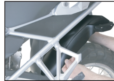
2 Place MudSling above rear tire and under the existing fender.