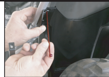
5 Hold the left side wing of the MudSling against the frame. Insert first zip tie up from the bottom through a slot. Zip tie head faces the tire.